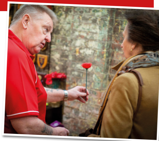
Princess Anne was delighted to meet the factory veterans and see their work.