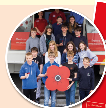
Aith Junior High pupils visit Bud.

If you would like Bud to visit your community in 2023, simply fill in our online form and you might see Bud setting up stall soon!